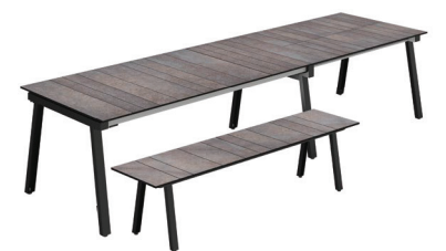
Matching bench MAXX05 MAXXIMUS Bench HPL 71" / 180 cm