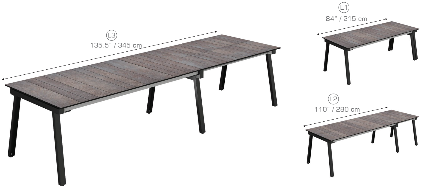
MAXX01 MAXXIMUS Extension Table HPL 84"-110"-135.5" x 39.5" / 215-280-345 x 100 cm